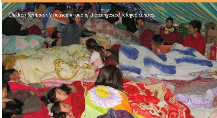
Children temporarily housed in one of the congested refugee centres.