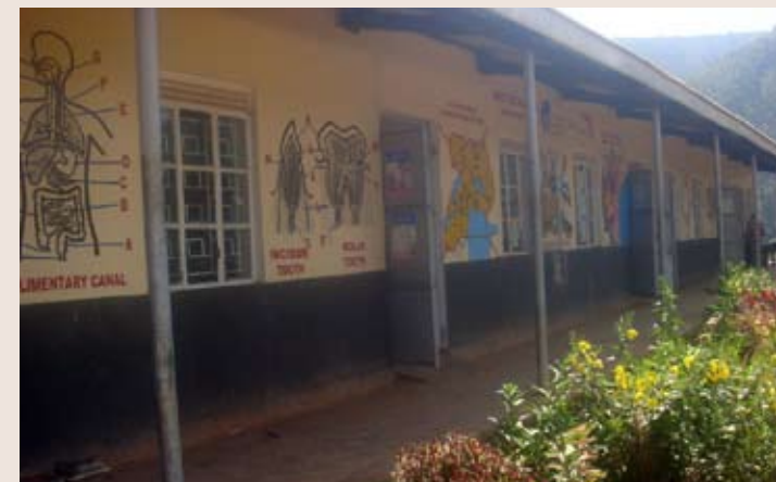
Kicucwe secondary school, North Rukiga uses its external walls for science diagrams.