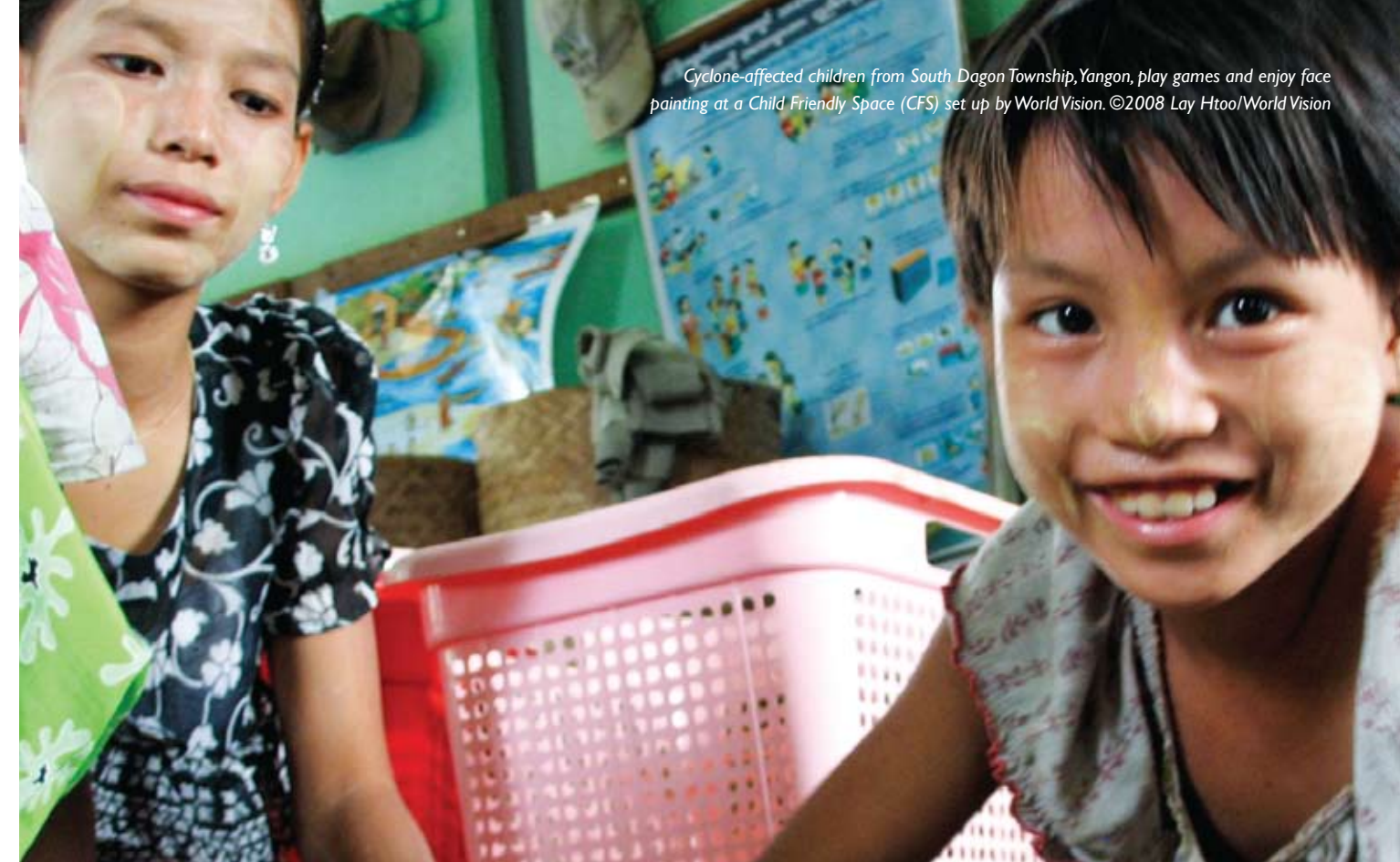
Cyclone-affected children from South Dagon Township, Yangon, play games and enjoy face painting at a Child Friendly Space (CFS) set up by World Vision.

World Vision's relief response is targeting some 338,000 people across the Delta and affected regions of Yangon. Priority areas are child protection, water, sanitation, hygiene, and food security.