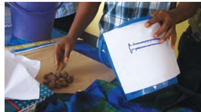
Votes are cast using stones and nuts to represent male and female priorities.

By identifying these problems we can then identify the solutions and nobody knows better than the community themselves as to what are the root causes for each issue and how best they can address them. The Imperi community decided that the most important areas for them to improve in the coming years are education, health, agriculture and water and sanitation. The 60 representatives then voted on what they thought should have the most focus. Voting was undertaken as each man was given 10 small rocks and each woman was given 10 small nuts. One by one, the community members would go and drop into 4 different buckets a proportional number of rocks depending on how important they saw the issue.