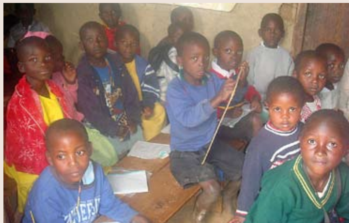
Pupils in an overcrowded North Rukiga primary school.

Poor infrastructure is part of the problem. Thousands of children are still taught under trees or in poorly constructed classrooms, with little or no furniture and no school books, pens or copy books. The toilet facilities are often nonexistent or very poor and only one in a hundred students knows what a computer looks like. Teacher to pupil ratios of one teacher for every 110 pupils makes class management difficult and children with special needs and slow learners are left behind. School committee members are often illiterate themselves and so struggle to manage their schools effectively.