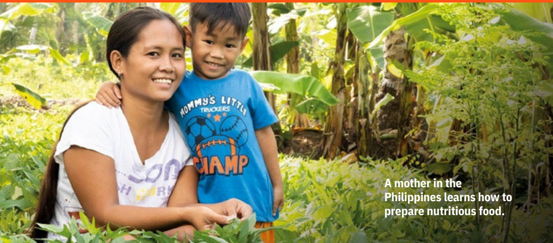
A mother in the Philippines learns how to prepare nutritious food.

Writing your Will is a time to consider what you own, the people and causes most important to you and what you'd like to leave behind.