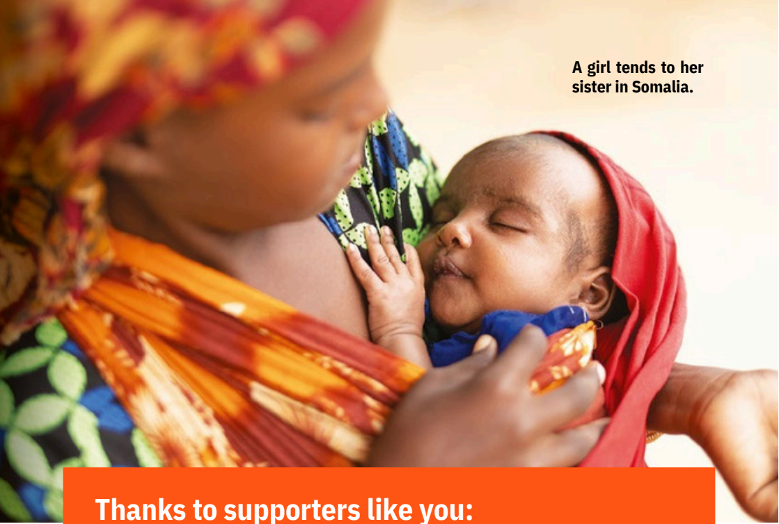
A girl tends to her sister in Somalia.